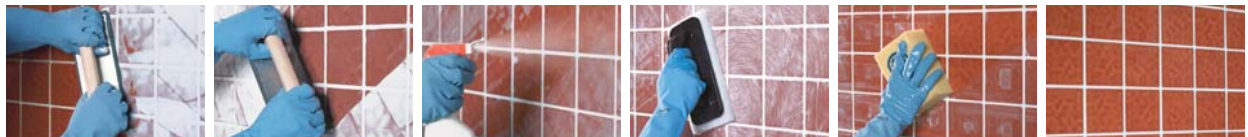
ARDEX WA: Application